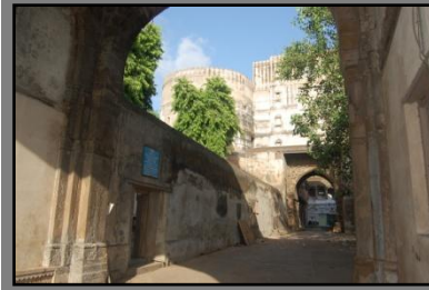
Bhadra Gate, Ahmadabad

Please fill up the attached form and hand it over to the Registration desk latest by 16:00 on the July 15, 2010. Please note that there are limited seats available and the registration will be done on the first come – first serve basis.