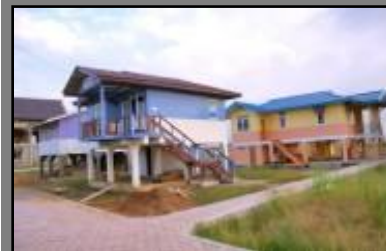
Community designed houses: Source: www.hunnar.org