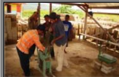
Community members using earth ramming machine: Source: www.hunnar.org