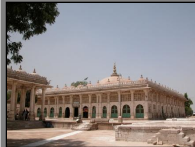
Sarkhej Roza Complex