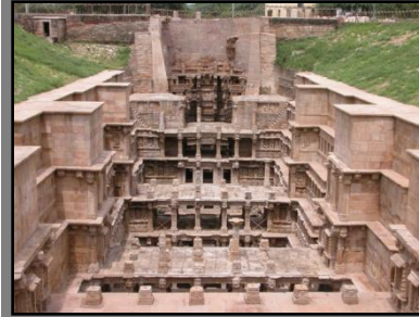
Rani ki vav, Patan